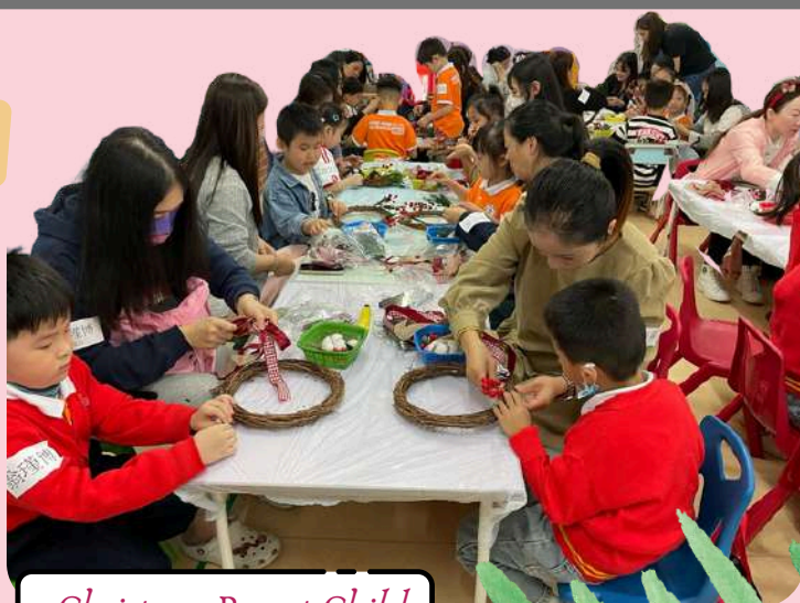
Christmas Parent-Child Wreath Making