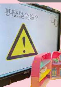
Home Safety Tips Workshop

In addition to being a social worker, I am a mother of a 6-year-old child. My daughter has just finished three years of kindergarten. As a mother, I like everyone else. I can vividly recall all of the events, difficulties, and obstacles that occurred. Each child is a gift from God with his or her own distinct personality and characteristics. Children are vibrant and active as well as mischievous. Therefore, we have to stay alert and work hard along side with them to build a healthy relationship. Some children may be gentle and simple to follow, but they may also have developmental difficulties that create anxiety for their parents. There's an ancient saying: "Raising a child for a hundred years means worrying about him for ninety-nine years." This may accurately describe the feelings of parents all around the world! We may have to face numerous hurdles and challenges along this process before we can finally make it through. However, every time a hard time has passed, I feel I have achieved another stage in my challenge and I have more things to learn. As a result, I am really excited to accompany you here at Kam Chuen on this tough and rewarding journey together!